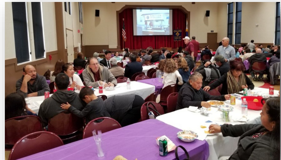
Guests enjoying a hearty family feast