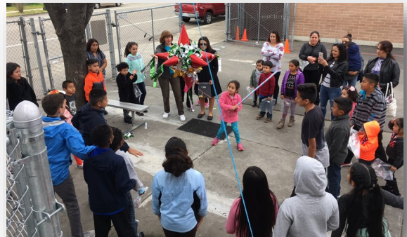
Children attacking piñata after enjoying movies, popcorn and pizza