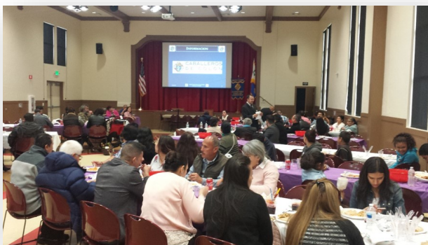
Knight Irving Garcia (background standing) answers questions from the audience