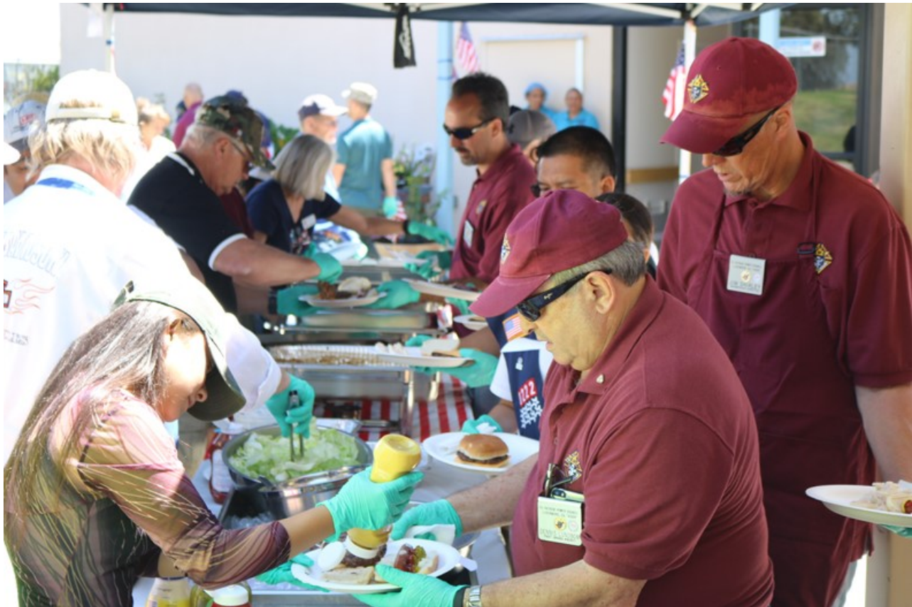
Knights preparing meals to serve to 150 residents, guests and staff.

With experienced Knights manning the grill, the VA residents were treated to traditional Fourth of July fare - hot dogs, hamburgers, salads, cookies and root beer floats. The hospital's serene hilltop venue, combined with perfect weather under beautiful blue skies, provided a stunning background for this fun event. The veterans shared their moving stories and experiences with eager listeners. Everyone who participated came away with a greater appreciation for the significant contributions these heroes have made to protect the freedoms that we all celebrate on this patriotic holiday.