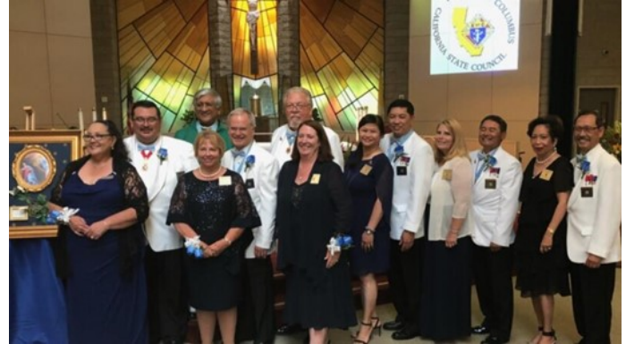
Newly installed State Officers and their wives