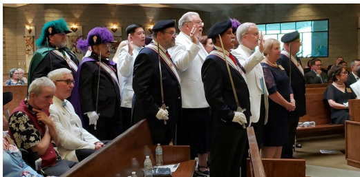
State Officers with 4th Degree Color Corps escorts