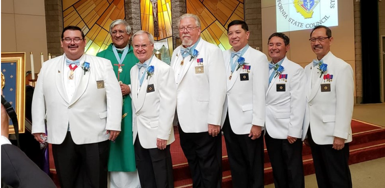
Newly installed State Officers