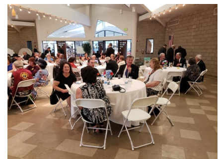
Some of the guests who attended the dinner