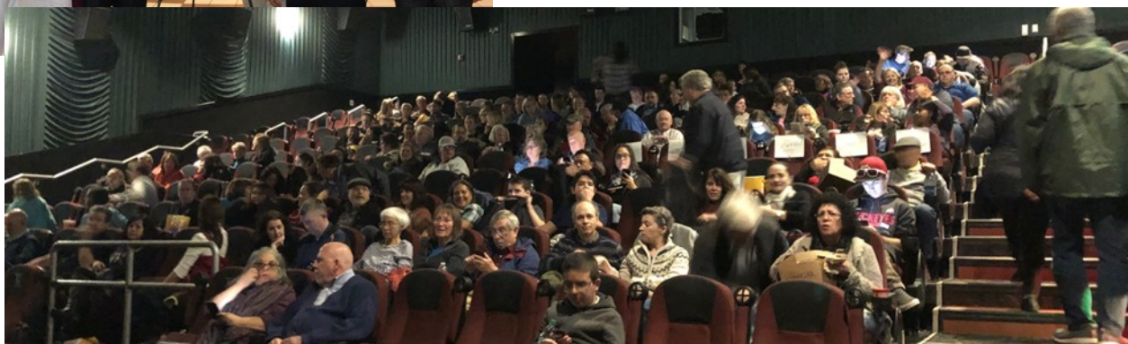
The pre-screening played to an enthusiastic full house on Wednesday evening.