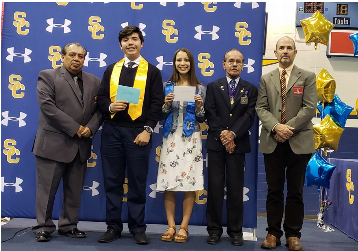
Santa Clara High School awards ceremony 2019, Knights of Columbus Oxnard Council 750 presented 2 scholarship awards of $500.00 each.