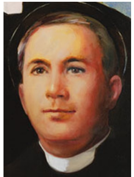
Saint Father Mateo Correa Magallanes