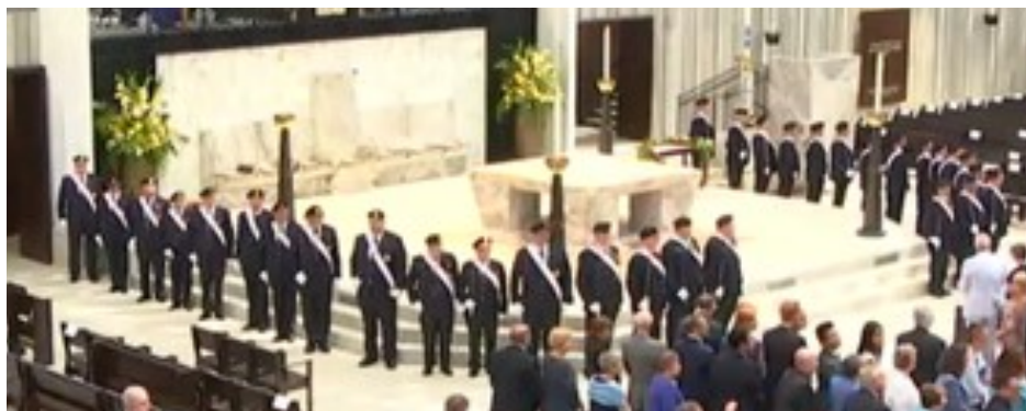
Altar Space—Fourth Degree Sir Knights from the Southern District await the entrance of priests, deacons, and bishops for dedication mass.