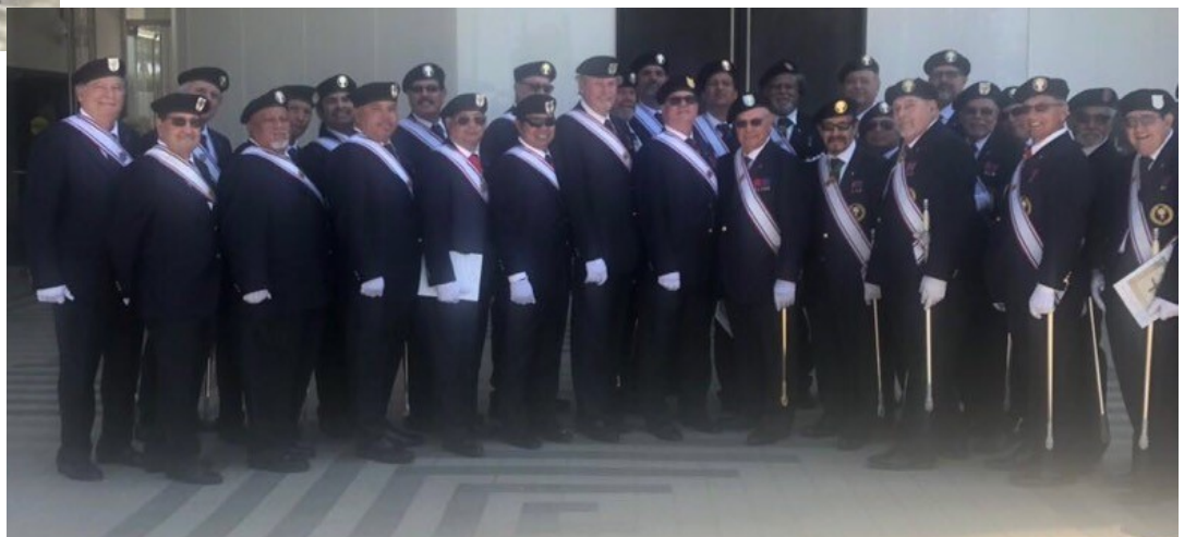
Sir Knights from Southern California District - Saint Junipero Serra Province