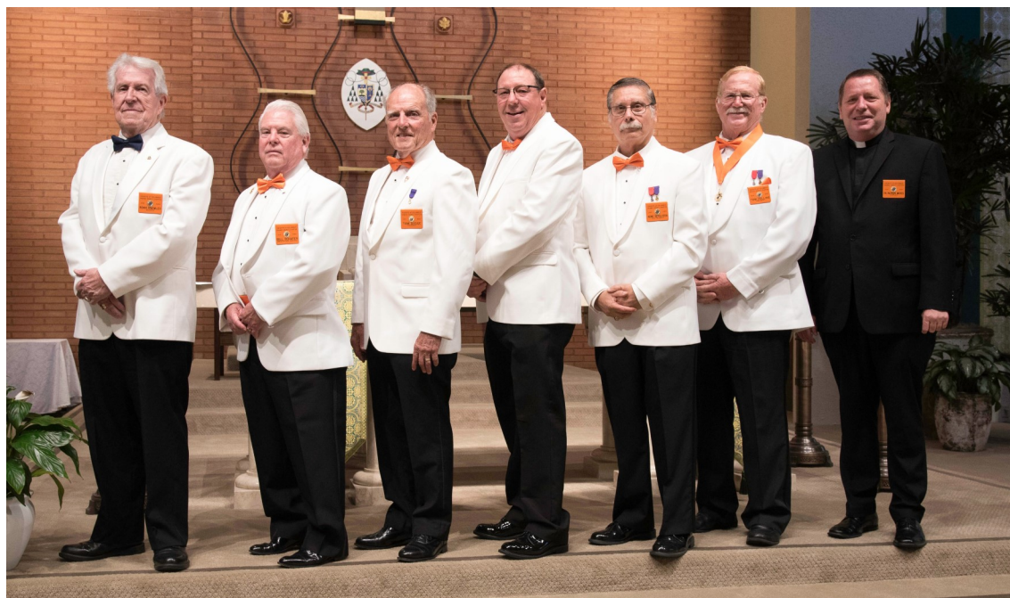
Pictured above (l to r) - Orange County Chapter Officers CY 2019-2020

Installation of Officers and State Deputy Testimonial July 18, 2019 at Holy Family Church in Orange