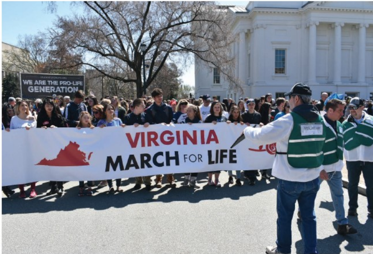
Knights serve as marshals during the inaugural Virginia March for Life, held April 3, 2019, in Richmond.

Catholic Conference, the bishops' official public policy voice.