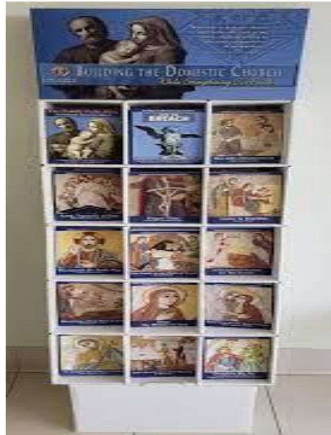
"Building the Domestic Church Kiosk"