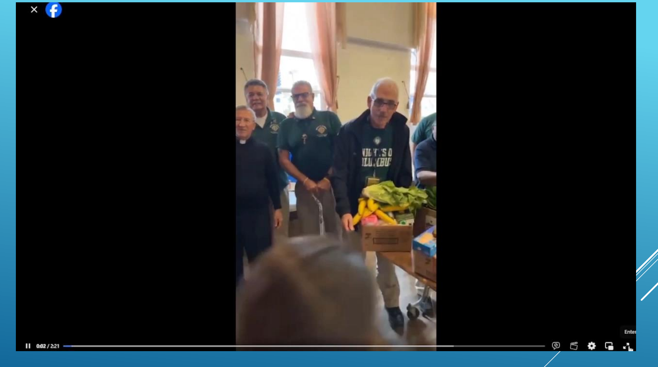
SERVED 200 FARM WORKERS FAMILIES