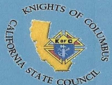
Star Tracker, Fraternal Year 2021-2022

I Will Show My Faith Through My Works! Mother Mary Pray For Us